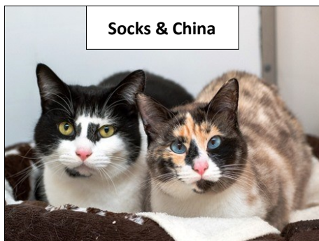
Socks & China

Hello my name is China . I'm 2½ years old and I live with my friend Socks . He's 3; he's very shy so I'm writing for us both (the big wimp)!