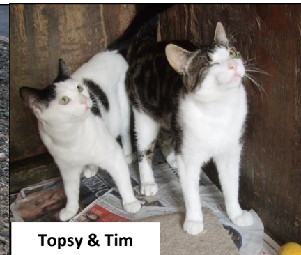
Topsy & Tim

Topsy and Tim are a beautiful pair of young cats who we are assuming to be brother and sister. They were left outside Windyway in the box pictured above, but had escaped before we found the box. All we knew was that the masking tape was inscribed with "CATS INSIDE". Later in the morning a pretty young female made herself known to us in the driveway but we didn't find the other cat until we were about to leave for the Vet's—we found him cowering beneath a car in the driveway (he hadn't been there 30 minutes earlier) with a badly injured eye. He must have been hit by a car after escaping from the box. Miraculously he had no other injuries and recovered very quickly from the removal of his right eye—probably due to getting treatment so quickly. We have named them Topsy and Tim and they are such loving, happy friendly cats we can't imagine what was going on in the minds of whoever left them. She is really talkative and outgoing, he is a little more reserved but he is probably still learning to deal with his disability. Having said that he should be able to lead a full, active life and we would love to home them together.