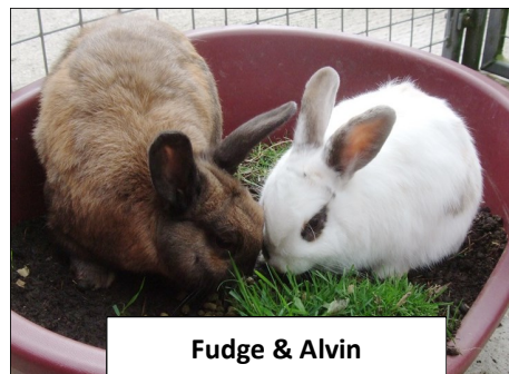
Fudge & Alvin