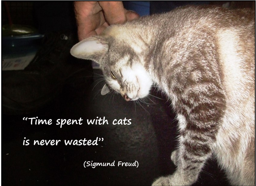
“Time spent with cats is never wasted” (Sigmund Freud)

Hello and welcome to our Summer Newsletter. We are experiencing our busiest summer in memory for sheer numbers of abandoned animals, especially pregnant cats and kittens, so apologise for this edition being a little later than usual. The cat pictured below is one we have named Willow—she arrived highly pregnant and gave birth to 5 kittens in late July. She will be looking for a new home in late September. Inside we have the usual mix of news—some animal profiles, some happy endings and also reports on some of the events we have had. I'll begin with the updates on the animals featured in the Winter news; All three dogs; Buster, Bedbug and Lucy have happily found homes, as have the two bunnies; Hancock and Primrose. The three cats; Lily, Faith and Emily are still waiting although a few people have come forward to adopt semi feral farm cats. Tyson the elderly German Shepherd with CRDM is still here as well and if you think you may be able to offer him a place in your home for him to live out his days please do get in touch with us. He cannot live with children, cats or other dogs.