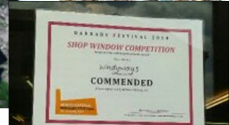
Barnaby Shop Window award