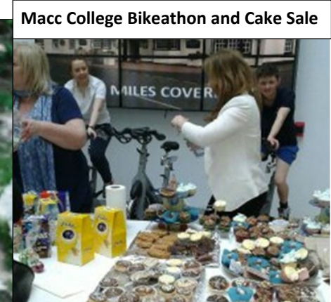
Macc College Bikeathon and Cake Sale