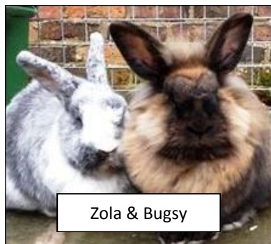
Zola & Bugsy

Lily, Faith and Emily all came to Windyway separately but for the same reason. They were strays who were being fed who turned out to be in kitten. None of the people feeding them felt it would be fair that they should have their kittens and continue living outside.