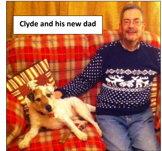
Clyde and his new dad

Ronnie the collie arrived at Windyway about three years ago, having been in a home with a young girl who adored him. Unfortunately, however, he developed some problems; being aggressive on occasion with other dogs and not always reliable with people. The family therefore felt they could not keep him, and with much regret signed him over to Windyway. Ronnie clearly found life in a rescue kennels somewhat fraught, although it is difficult to say if he felt threatened, anxious, depressed, lonely or a mixture of all of these. As a volunteer he soon became a favourite of mine, for despite the difficulty of his barking and pulling on the lead as he walked past the other kennels, and an occasional nip as he was returned to his kennel, he was actually a pleasure to walk. He was friendly and affectionate, running back on the flexi lead to sit at my feet for a stroke. However he didn't show himself to best advantage to prospective rehoming, and after a long period a friend and neighbour of mine, also a WW volunteer, decided first to foster him, and then to take him on full time. Despite being 10 years old, he has settled well into life with three other collies and it has been wonderful to see a different dog emerge under the love and care of his new owner. I am still lucky enough to walk him regularly, and a relaxed, happy dog, with a grin on his face, runs over the fields, jumps over the stiles, splashes in the stream, and has fun. Ronnie; a friend, and a dog in his element.